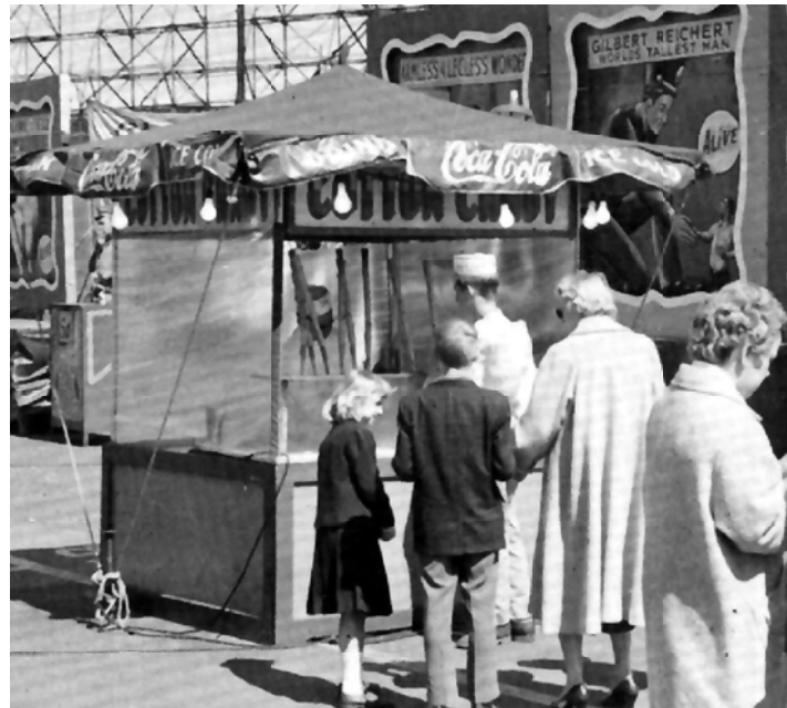
Popcorn stand on the midway of the Clyde Beatty-Cole Bros. Circus in 1957. Note the glass enclosed stand, a modern sanitary requirement that earlier shows did not have.