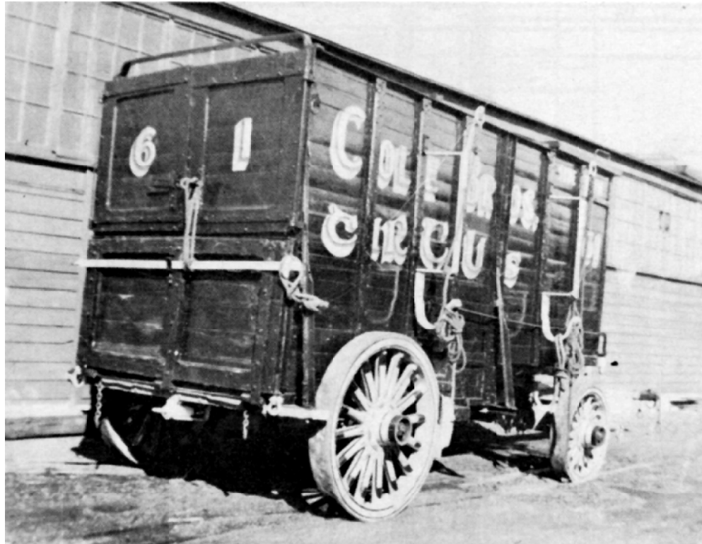
Cole Bros. Side Show Wagon No. 61, seen at winter quarters, Rochester, Indiana. The exact year of this photo is not known, but from indications, quarters were very active at the time.