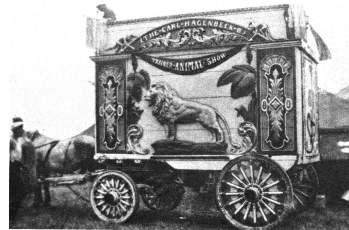
Lion Tab Wagon as it appeared on the Hagenbeck-Wallace Circus in about 1930.

According to Gordon Carver in the Jan-Feb 1997, LCW, the Lion Tab wagon is exclusive of the mudboard and skyboard 5' 8" high, 12' 6" long and 6' wide exclusive of the carvings which are only about 4" thick. Please note that there are some color differences between the 1930's view and the restored wagon.