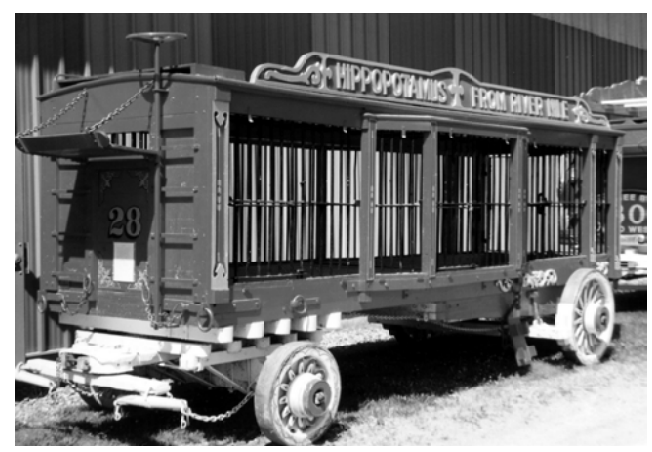
These two photo were taken in July of 1996 at the Circus World Museum in Baraboo, WI.

Cole Bros. Circus Hippo Den Wagon No. 28