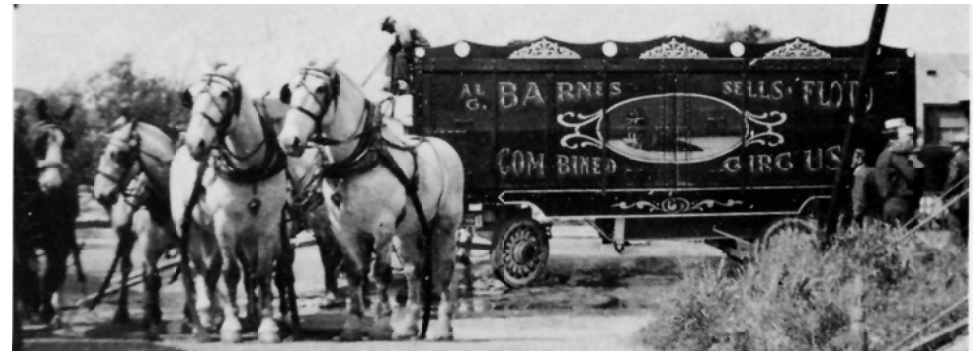
The Hippo Den on the lot - Inglewood, CA - April 1, 1937 (Mar-Apr 1990 LCW)