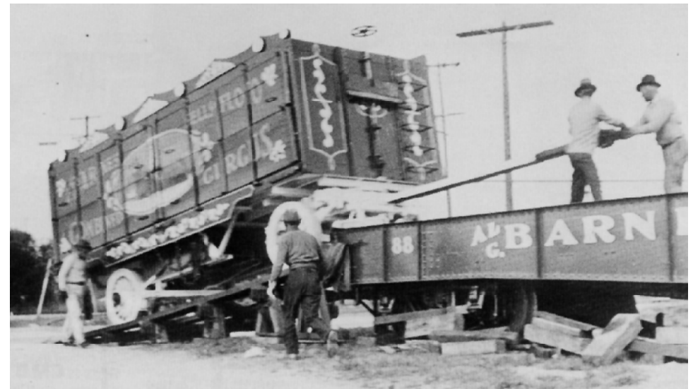
Hippo Den on the 1937 Al G. Barnes ~ Sells-Floto Circus going up the runs to the flatcar.