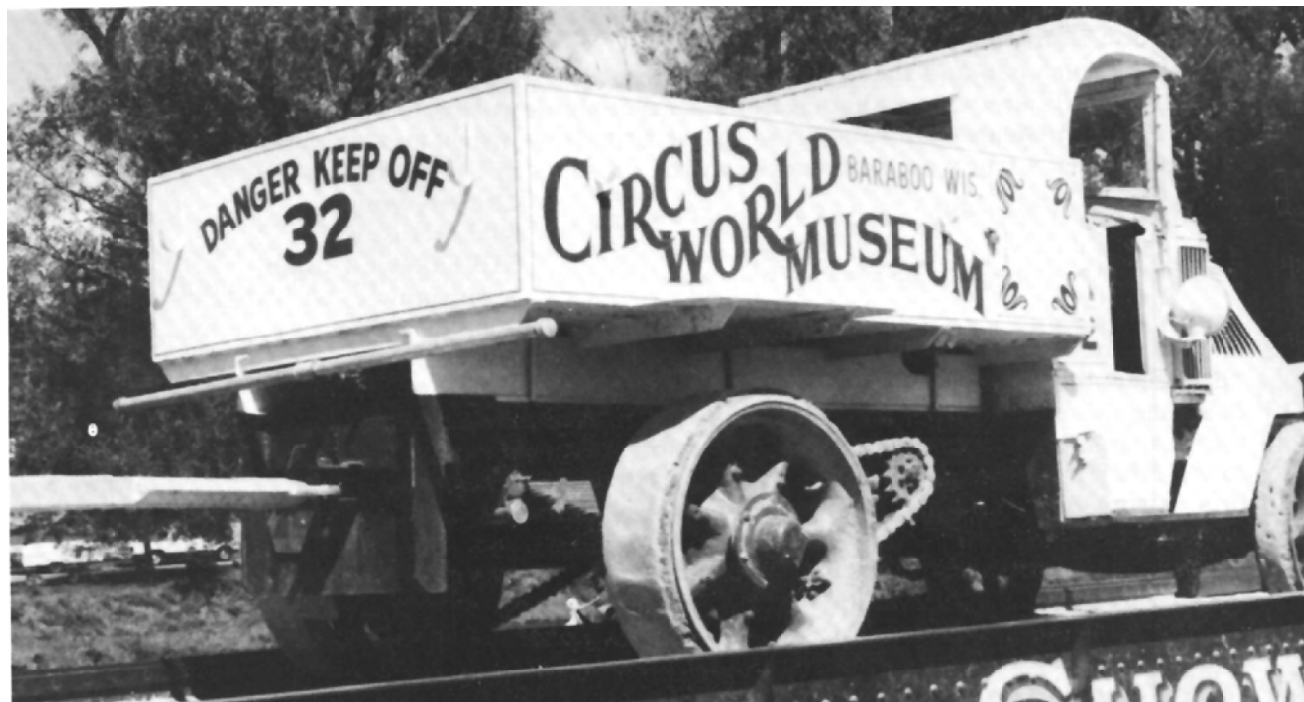
Rear View