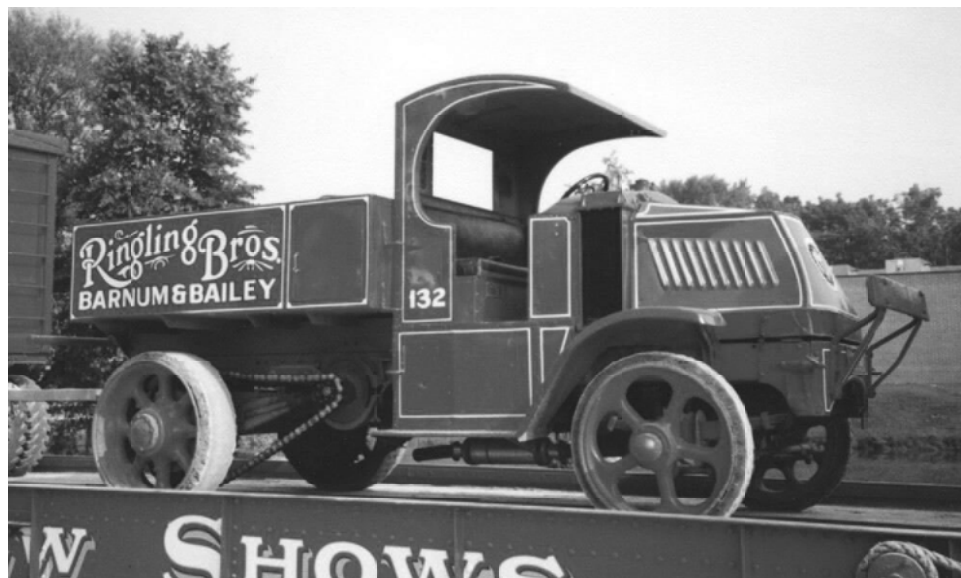
July 1996 view after the truck was painted in RBBB scheme

The tank as measured is white with all lettering red with a blue pin-stripe around the edges, except for the words Baraboo, WI which is all blue. There is also a blue pinstripe around all sides of the tank approximately 1" in from the edges. Also on the back where the hitch is, was painted red. The tank is all steel construction and all seams, angles, hooks, steps, etc. are welded. The front 2' of the tank is sectioned off and used for storage of hoses, tools, etc. [The truck was painted in RBBB colors sometime before 1996. Sup. of Plans]