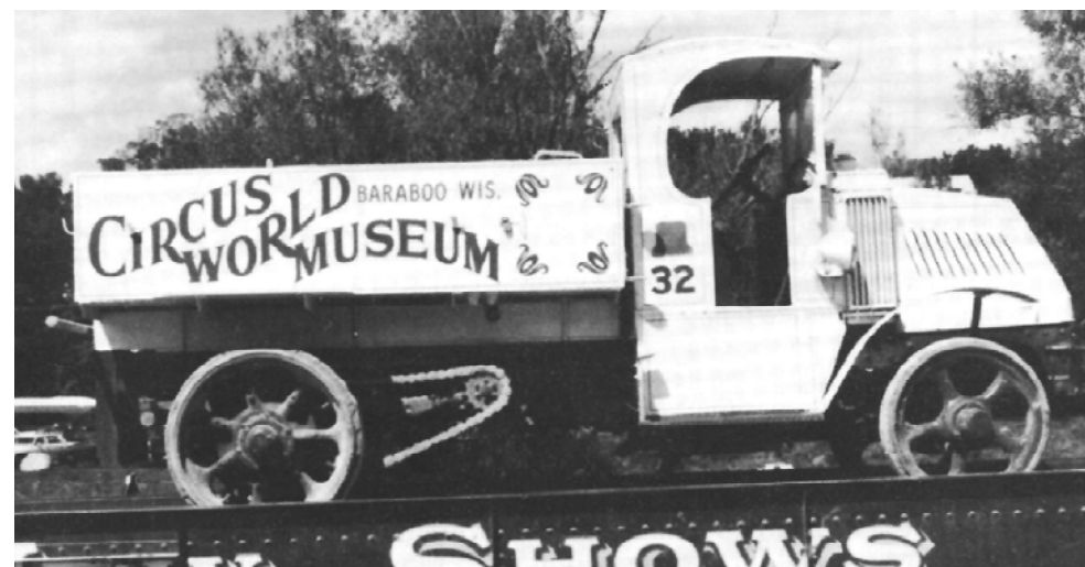
Side View