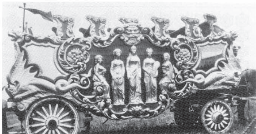
The Five Graces bandwagon as it appeared in the Hagenbeck-Wallace Circus parade of 1934.

The Five Graces wagon was originally on the Adam Forepaugh Circus in the 1870' and 1880's. It was originally a telescoping statuary wagon but was converted to a bandwagon in about 1880. It eventually was used on the Ringling Bros. and the Hagenbeck-Wallace shows.