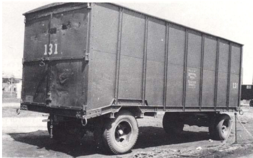
RB BB garage wagon No. 131 for auto in 1952.

Although this plan was originally labeled Car Wagon No. 99, it does not match the photos of No. 99. No. 99 did not have the channel framing on the outside and had different openings. This plan does match the above photo of No. 131.